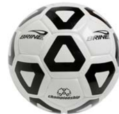
Official Ball of the PIAA Championships